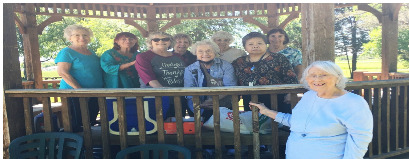
Devotions and refreshments in the gazebo