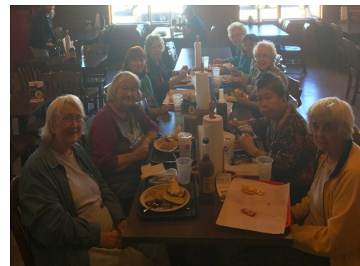
Lunch at Meyers Smoke House, Elgin